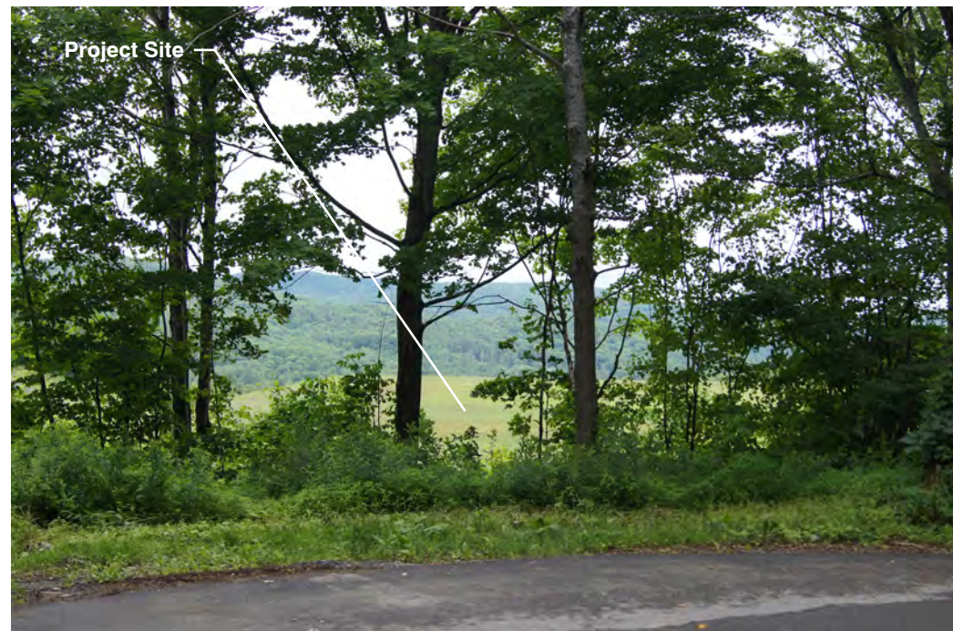
F- VIEW LOOKING SOUTH/SOUTHEAST FROM MINE ROAD TOWARDS PROJECT SITE