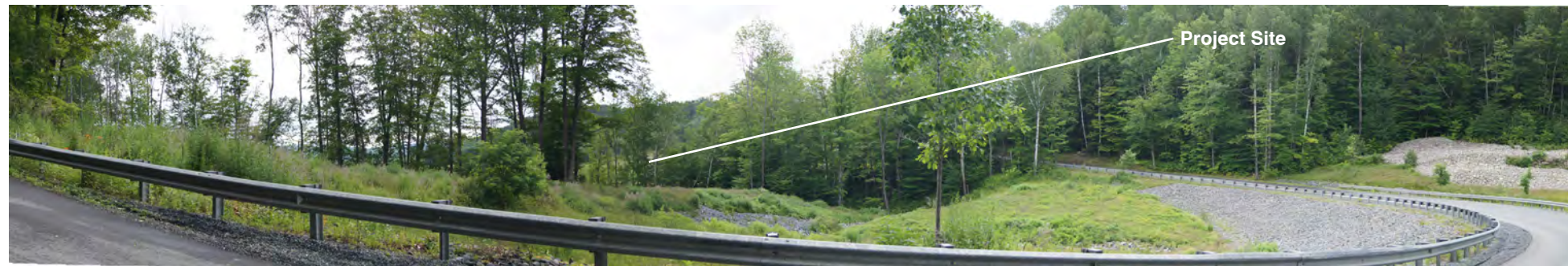
E1 - PANORAMIC VIEW LOOKING EAST FROM MINE ROAD TOWARDS PROJECT SITE