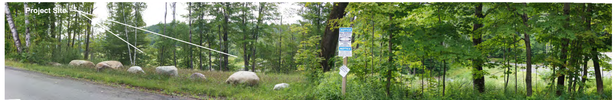
D1 - PANORAMIC VIEW LOOKING EAST/SOUTHEAST FROM JUNCTION OF MINE ROAD AND COPPERAS ROAD LOOKING TOWARDS PROJECT SITE

All Photographs taken by SE Group using a Sony SLT A55V camera with a 52mm focal length (35 mm equivalent) on 07/08/15 from 9:15-10:30 AM Panoramic views are for contextual purposes only.