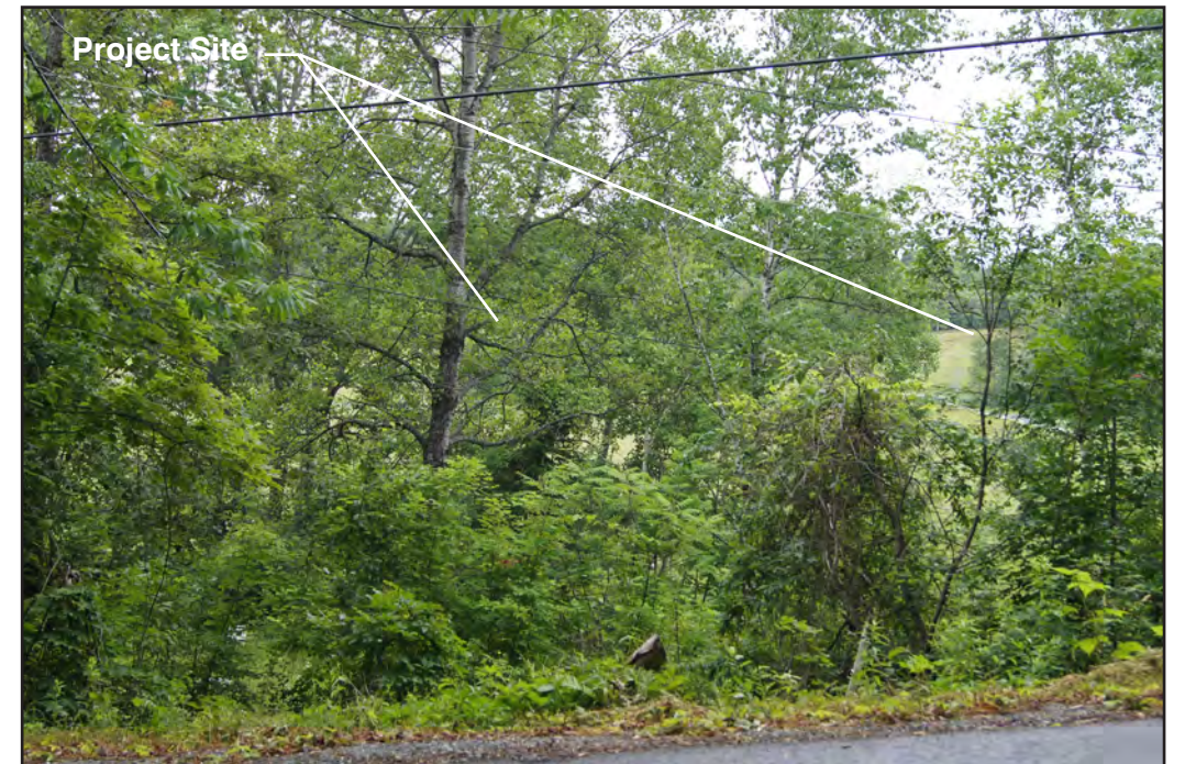
B - VIEW LOOKING SOUTH/SOUTHEAST FROM MINE ROAD TOWARDS PROJECT SITE

Panoramic views are for contextual purposes only.