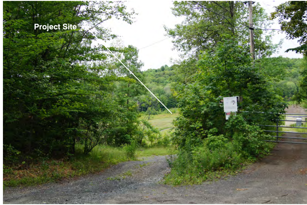
A - VIEW LOOKING SOUTH FROM ENTRANCE TO SITE OFF MINE ROAD TOWARDS PROJECT SITE