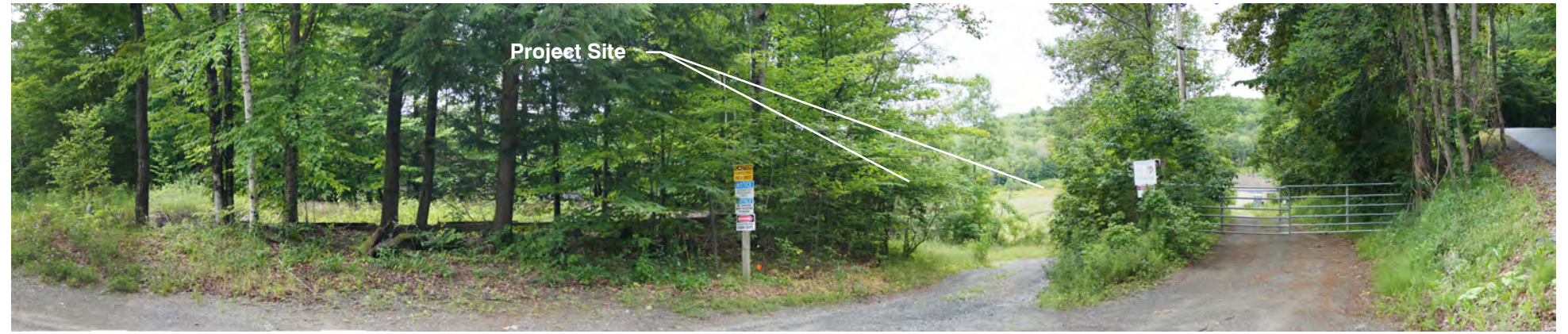
A1 - PANORAMIC VIEW LOOKING SOUTH FROM ENTRANCE TO SITE OFF MINE ROAD TOWARDS PROJECT SITE