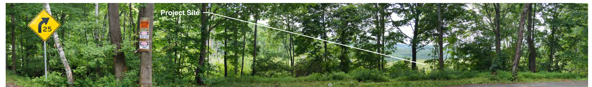
F1 - PANORAMIC VIEW LOOKING SOUTH/SOUTHEAST FROM MINE ROAD TOWARDS PROJECT SITE

All Photographs taken by SE Group using a Sony SLT A55V camera with a 52mm focal length (35 mm equivalent) on 07/08/15 from 9:15-10:30 AM Panoramic views are for contextual purposes only.