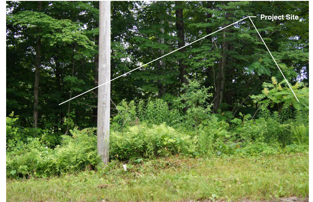
C - VIEW LOOKING EAST FROM MINE ROAD ACROSS FROM RESIDENCE LOOKING TOWARDS PROJECT SITE