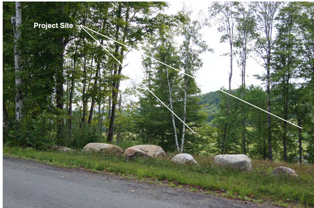
D - VIEW LOOKING EAST/SOUTHEAST FROM JUNCTION OF MINE ROAD AND COPPERAS ROAD LOOKING TOWARDS PROJECT SITE