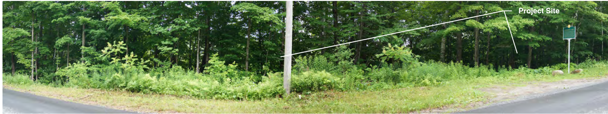
C1 - PANORAMIC VIEW LOOKING EAST FROM MINE ROAD ACROSS FROM RESIDENCE LOOKING TOWARDS PROJECT SITE