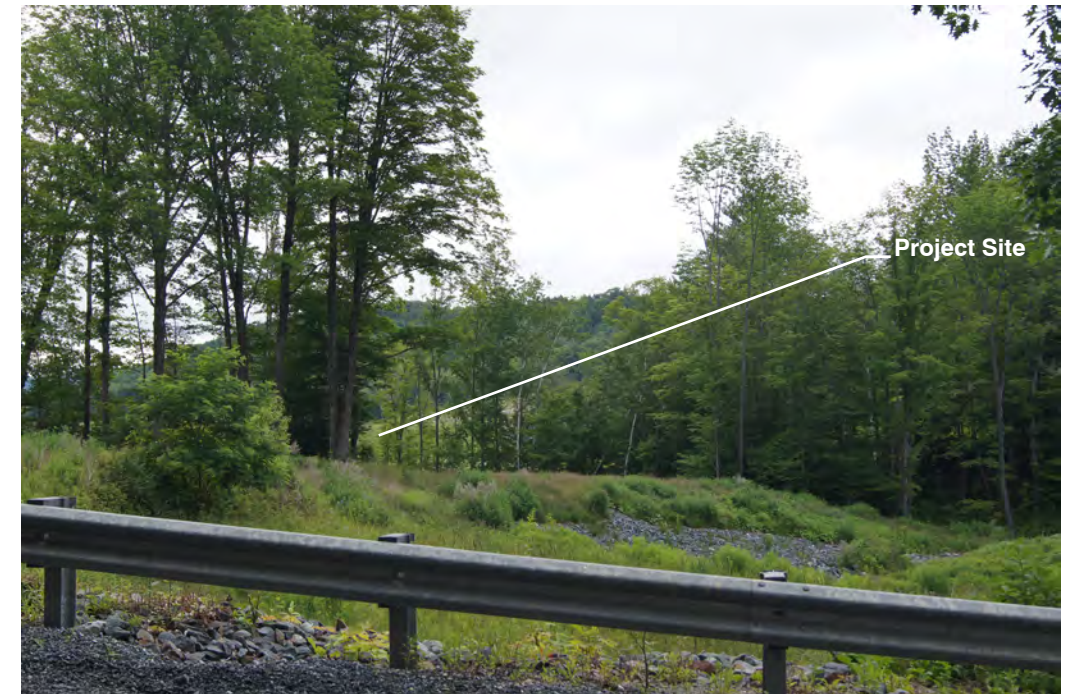
E - VIEW LOOKING EAST FROM MINE ROAD TOWARDS PROJECT SITE